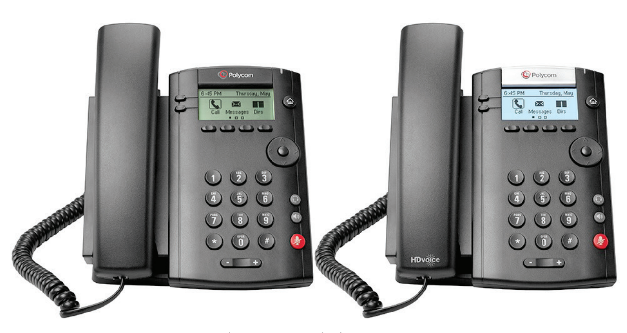
Polycom VVX 101 and Polycom VVX 201 \,

Select the Call Queue (CQ) soft key and follow instructions on the IVR.